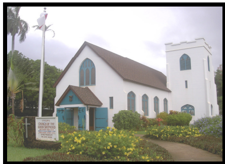
For the Love of God