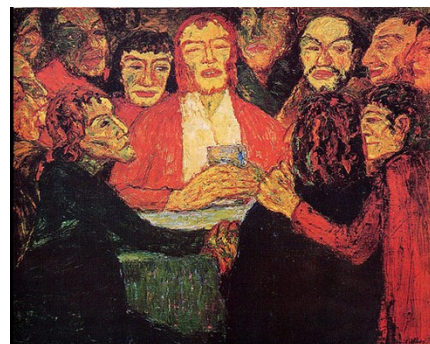
Emile Nolde The Last Supper. Early 20th century

Maundy Thursday, Good Friday, and Easter. In the ancient church they called it "being lead into the mysteries". You hear it today in the liturgy when the priest says "Let us proclaim the mystery of faith". We respond by saying, or singing, "Christ has died, Christ has Risen, Christ will come again."