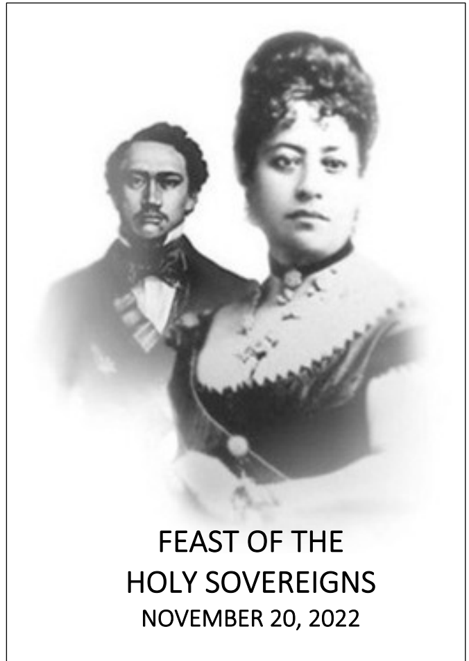
FEAST OF THE HOLY SOVEREIGNS NOVEMBER 20, 2022

You may call the parish office for more information 808-244-4656